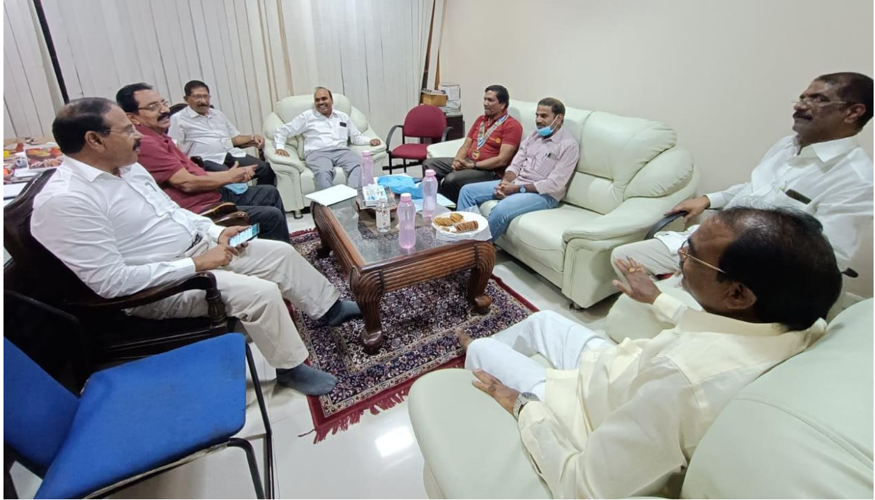
Club Assembly meeting held on 13.02.2021