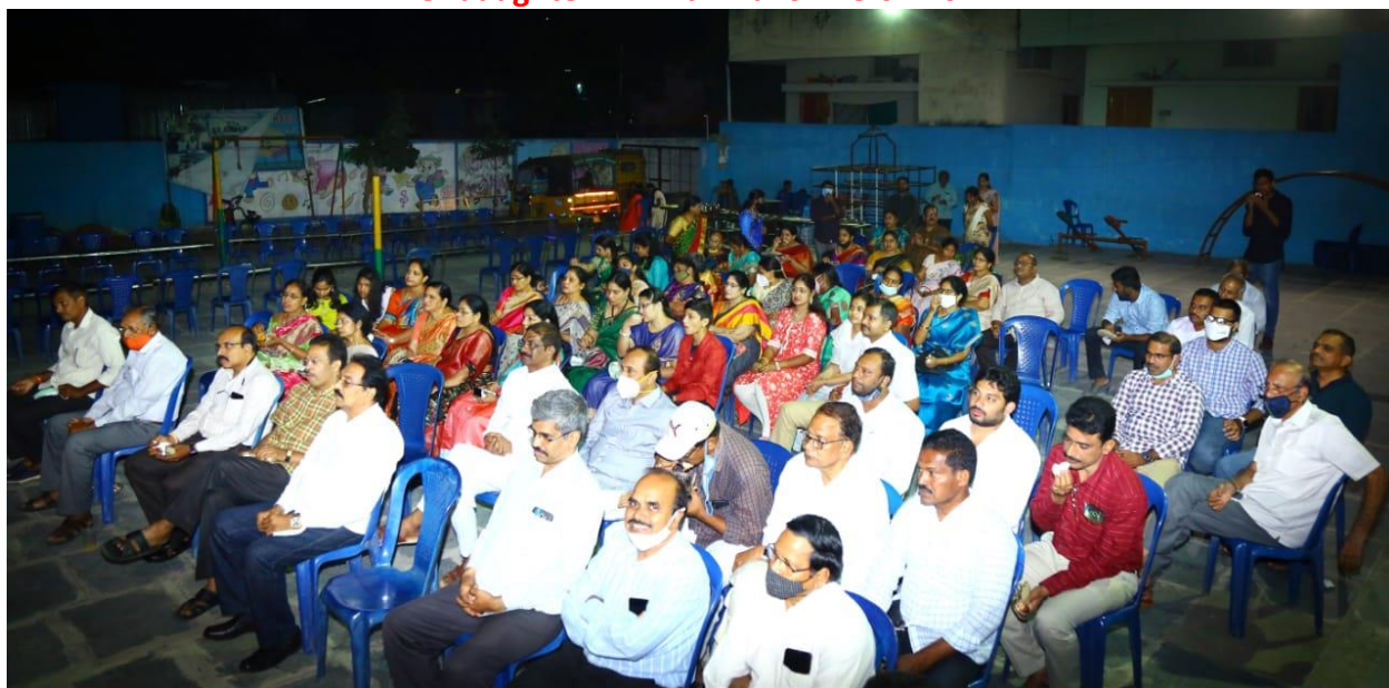
Members and guests attended the family meet on 28.02.2021 at St.Xavier's Public School, Nallapadu.