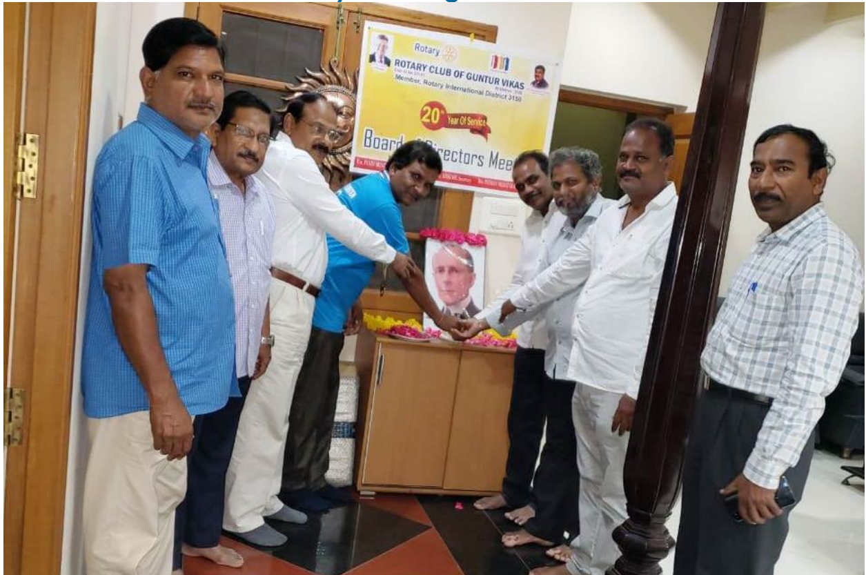
In Board of Directors Meeting held on 23.02.2021, Rotary founder Paul Harris was commemorated.