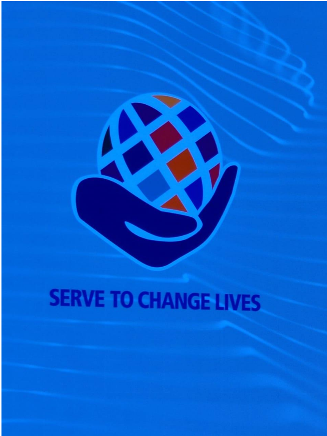
Rotary International 2021-22 year Theme "Serve to change lives"