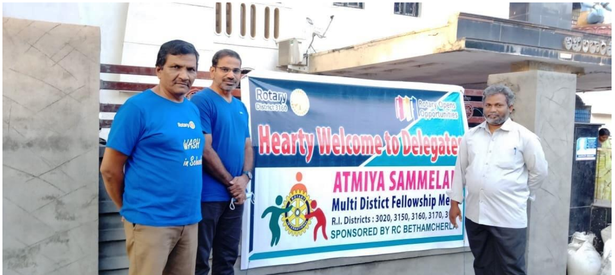
Some of Our members with their family members participated in Multi District Fellowship meet "Atmiya Sammelanam" at Srisailam on 07.02.2021