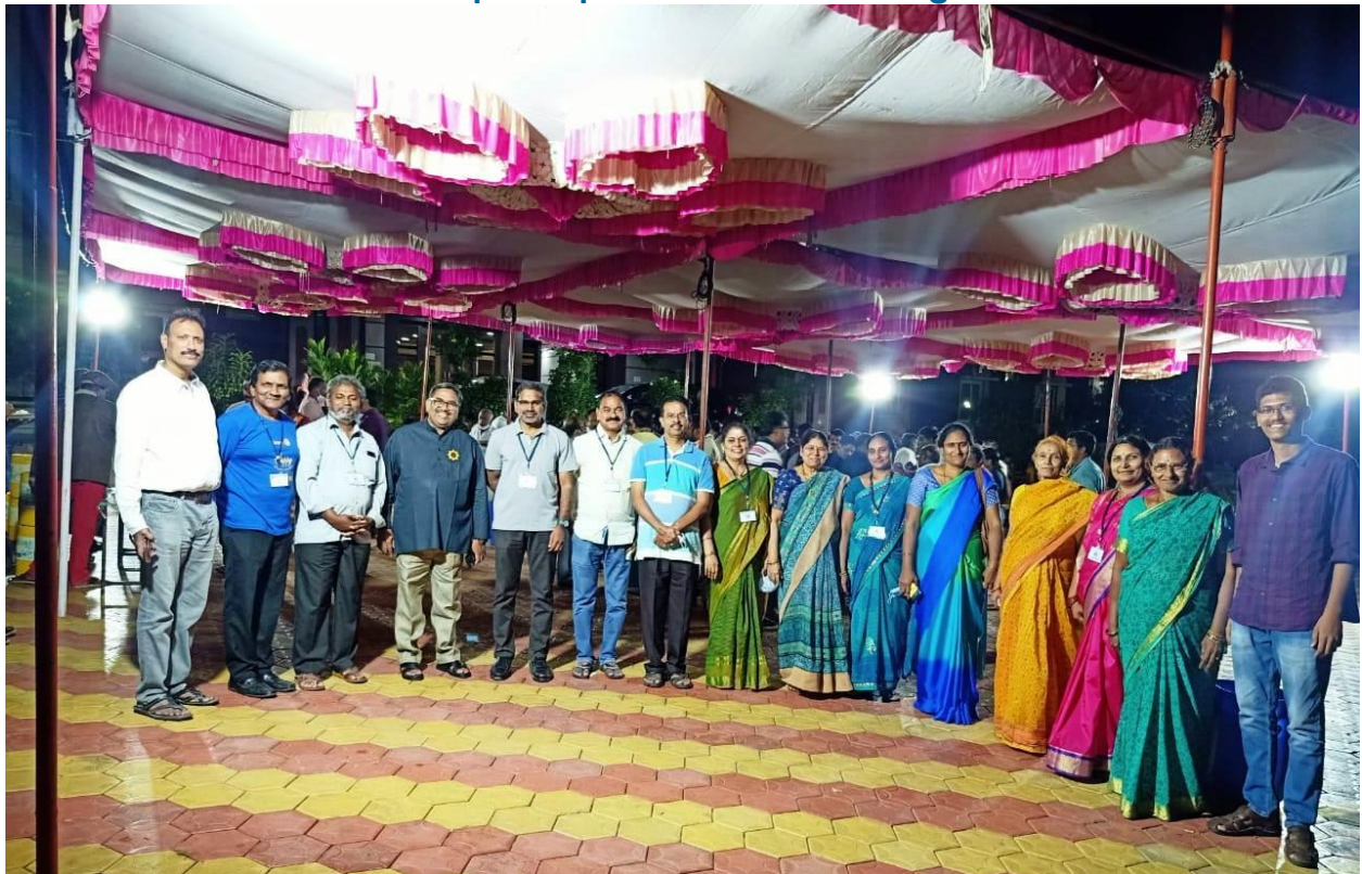
Our members with their family members participated in Multi District Fellowship meet at Srisailam on 07.02.2021