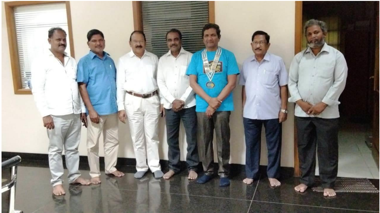
Board of Directors who participated in BOD Meeting held on 23.02.2021